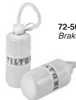
72-503 Brake Bleeder Kit